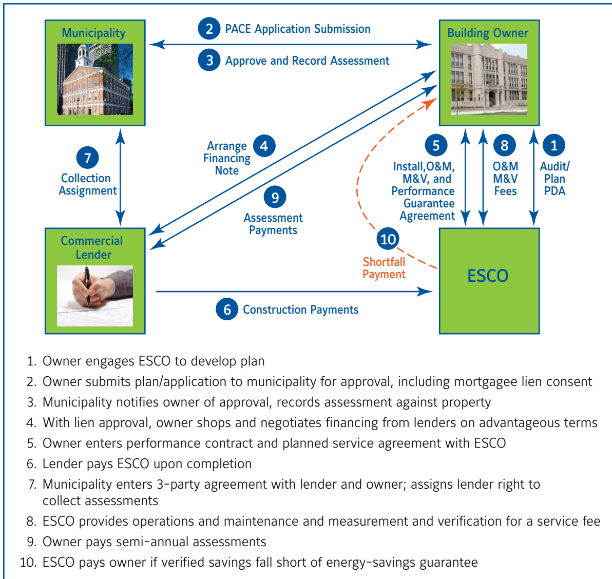
Figure 2. Owner-Arranged PACE Process for Commercial Buildings